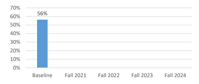
Outcome 2b: One-Year Success Rates

Percentage of veteran students (part- and full-time) enrolled for the first time in credit courses/programs at GRCC who were still enrolled, graduated, and/or transferred out by the end of the next fall. Baseline includes average of fall 2018, fall 2019, and 2020 cohorts.