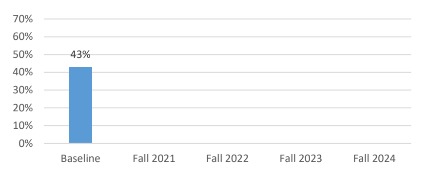
Outcome 3: % Graduate or Transfer within Three Years

Percentage of veteran students (part- and full-time) enrolled for the first time in credit and non-credit courses/programs at GRCC in fall, who graduated from GRCC and/or transferred out within 150% of expected time. This measure does not include students still enrolled. This measure will be updated at the end of each major academic term.